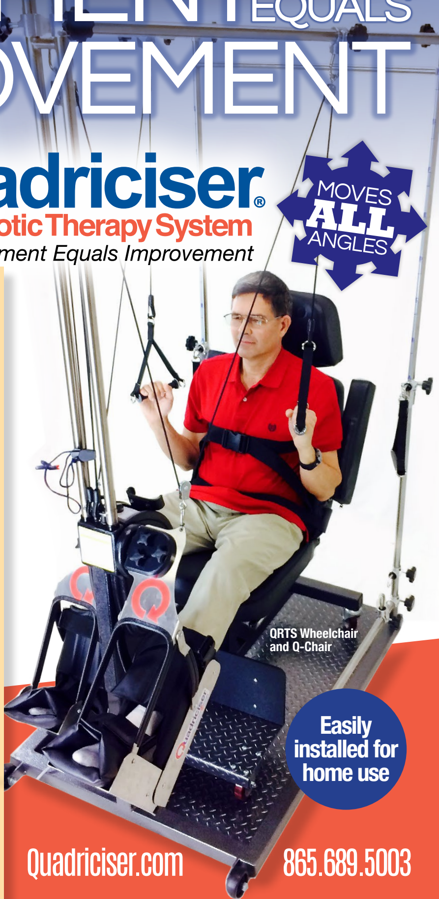
QRTS Wheelchair and Q-Chair